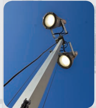
Two-head option available